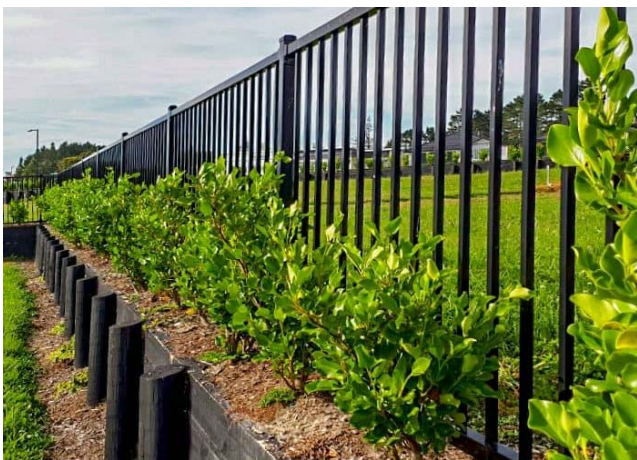
3 DURAPANEL TITAN fence panel and post system 1 : 50