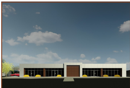
COMPLETION OF THE MEDICAL PRECINCT.

The new year promises exciting developments at Frontier Estate. Here's a glimpse of what's on the horizon: