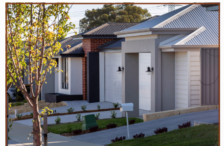
TWO NEW SHOW HOMES COMING TO STAGE 4.